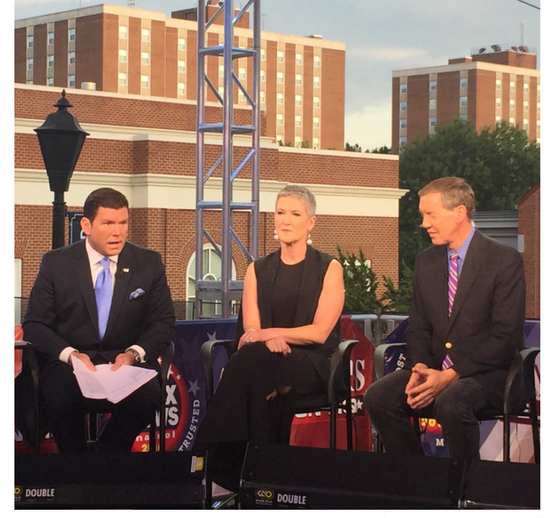
Fox News at Longwood on Debate Day

No matter how one plans to vote in this election, there is no disputing that the debate put the town of Farmville, if only briefly, on the map and highlighted the previously little-known role that Prince Edward County has had in shaping our country into what it is today.