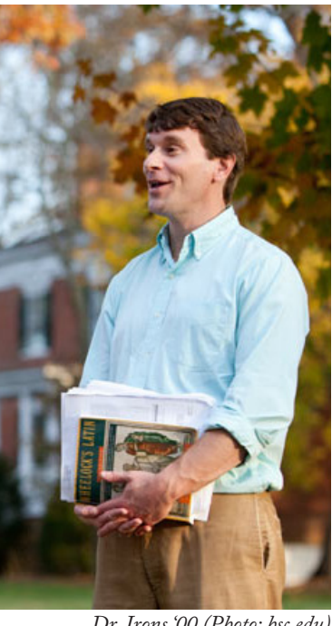
Dr. Irons '00

to have to kill these snakes, but I have a cat and she was in danger. It's not very likely that a cat is going to survive a bite by a copperhead, so I had to do it.